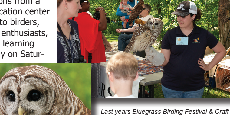
Last years Bluegrass Birding Festival & Craft Fair held at McConnell Springs Park.

day we will have vendors and exhibitors around the education center that will have a variety of exhibits and items for sale. Another returning fan favorite of this event will be Critters in the Classroom and their live birds of prey on both